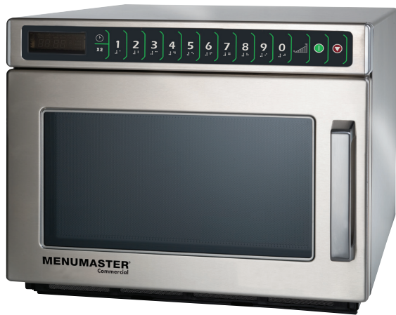
Model DEC14E2 shown