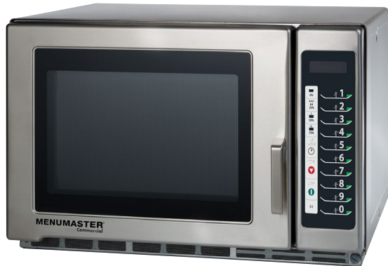
Model RFS518TS shown