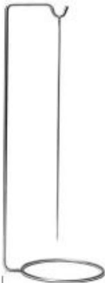
S.STEEL MEAT SKEWER with support Height 64,5 cm 25.39 in