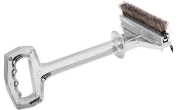
SPECIAL ALUMINIUM BRUSH Length 36 cm 14.17 in