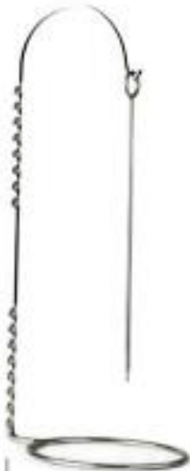
S.STEEL MEAT SKEWER with special support Height 58 cm 22.83 in