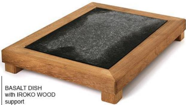
BASALT DISH with IROKO WOOD support