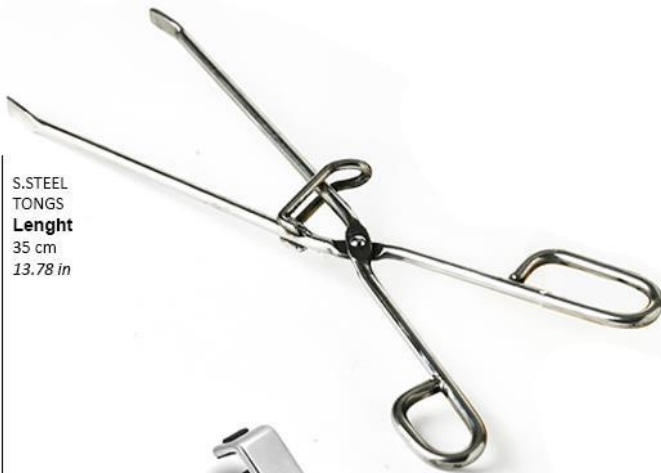
S.STEEL TONGS Length 35 cm 13.78 in