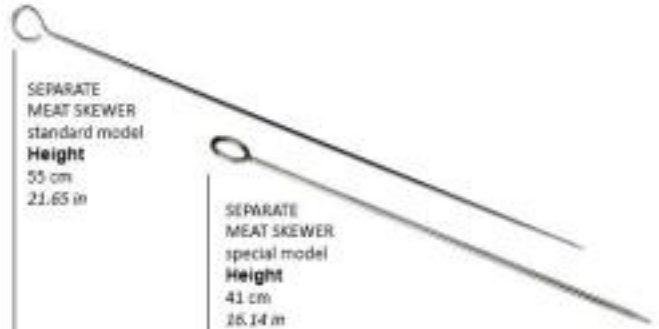
SEPARATE MEAT SKEWER standard model Height 55 cm 21.65 in