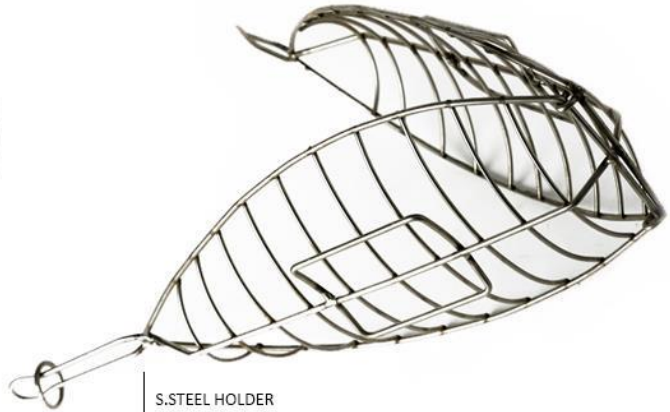
S.STEEL HOLDER Dimensions 46 x 19 x 10 cm 18.11 x 7.48 x 3.93 in