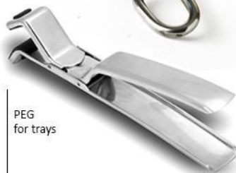
PEG for trays