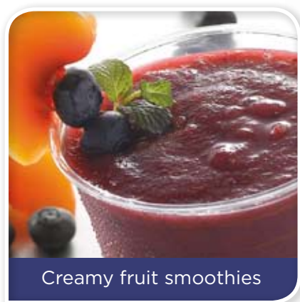
Creamy fruit smoothies