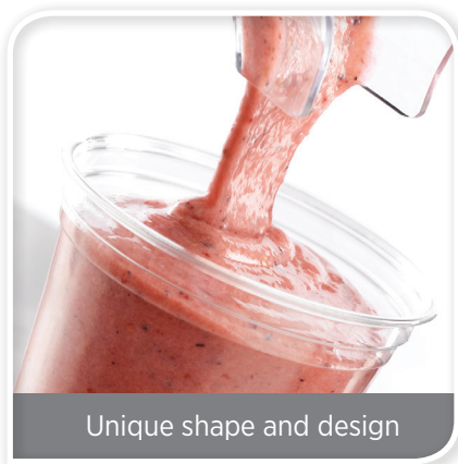
Unique shape and design