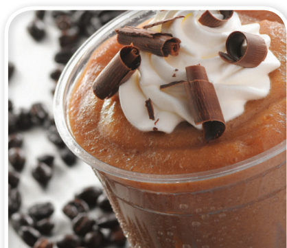
Creamy, blended coffee drinks