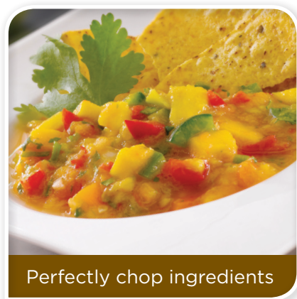
Perfectly chop ingredients