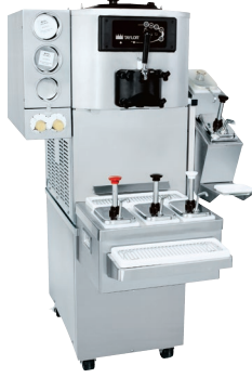
Optional Cart with rear door for front mount syrup rail