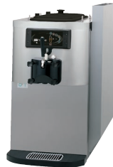
Optional Top Air Discharge Chute