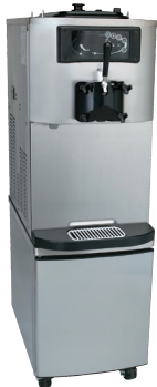
Optional Cart with front opening door