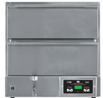
HBB0D2 CVAP HOLD/SERVE DRAWER Electronic Differential Controls