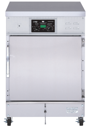
HA4509 CVap Holding Cabinet Electronic Differential Controls