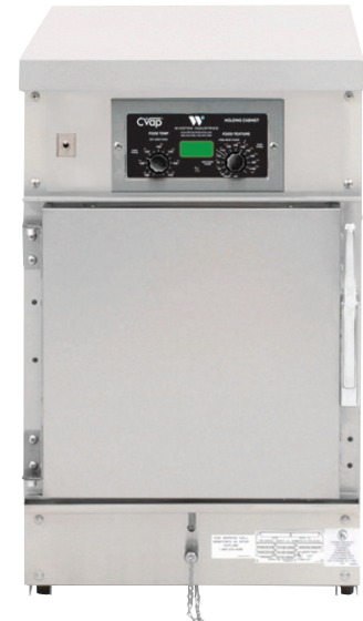
HA4503 CVap Holding Cabinet Electronic Differential Control

HALF SIZE UNDER COUNTER MODEL WITH FAN (SHOWN)