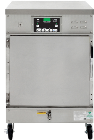
CAC509 CVap Cook & Hold Oven 8000 Series Electronic Controls

Installation Requirements Allow at least 2" (51 mm) clearance on sides, particularly around ventilation holes. Allow at least 18" (457 mm) clearance from heat producing equipment, such as ovens or fryers. Generally this equipment does not need to be installed under a mechanical ventilation system (vent hood). Check local health and fire codes for requirements specific to your location. Unit must be installed at level.