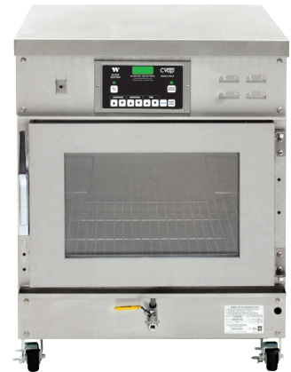
CAC507 CVap Cook & Hold Oven 8000 Series Electronic Controls

Installation Requirements Allow at least 2" (51 mm) clearance on sides, particularly around ventilation holes. Allow at least 18" (457 mm) clearance from heat producing equipment, such as ovens or fryers. Generally this equipment does not need to be installed under a mechanical ventilation system (vent hood). Check local health and fire codes for requirements specific to your location. Unit must be installed at level.